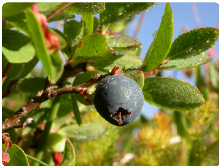
Floraison d'Altitude › Floraison et fructification › Fruits mûrs

Vaccinium uliginosum subsp. microphyllum (Lange) Tolm., 1936