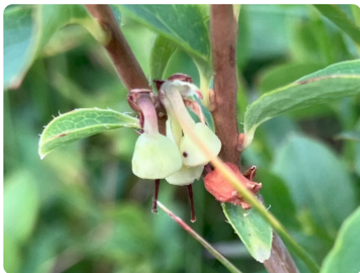
Floraison d'Altitude › Floraison et fructification › Après floraison