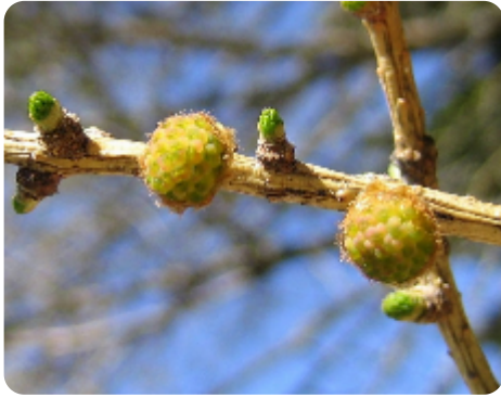
Phénoclim › Flowering › All the flowers are still closed