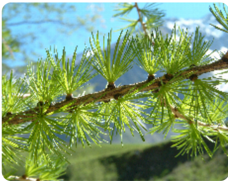
Phénoclim › Leafing › About 10% of the leaves have unfolded, the rest are still curled up.