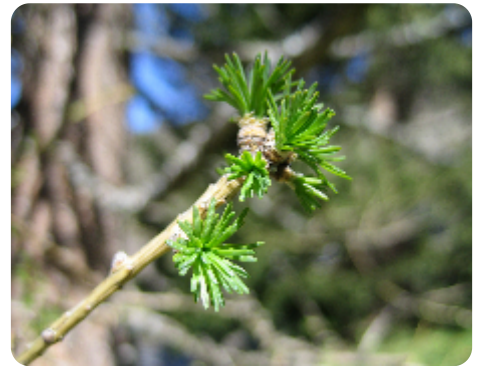
Phénoclim › Leafing › About 10% of the leaves have unfolded, the rest are still curled up.