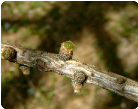
Phénoclim › Budburst › Around 10% of buds are open. The others are closed