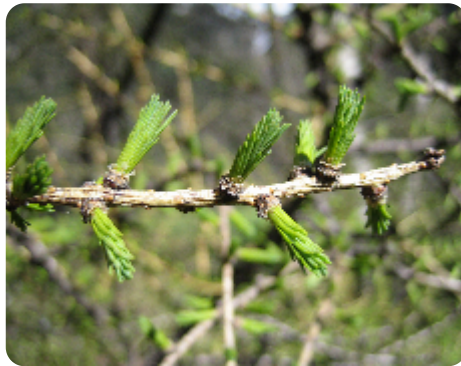
Phénoclim › Leafing › Leaves still curled up