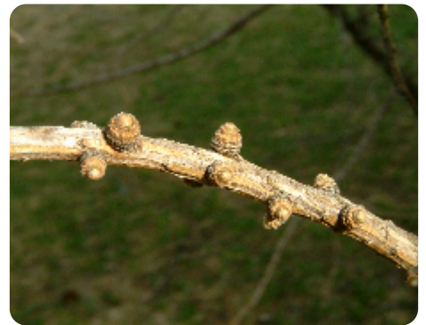
Phénoclim › Budburst › All the buds are still closed