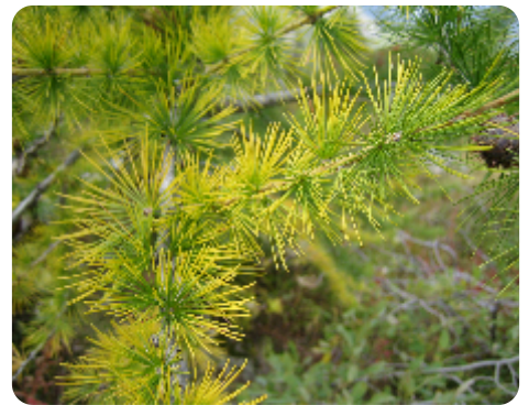
Phénoclim › Color change › Approximately 10% of leaves are beginning to yellow or have fallen off (the rest are green).