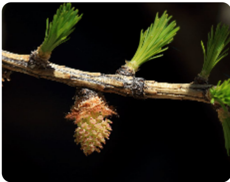
Phénoclim › Flowering › Around 10% of the flowers are open and the rest are closed.