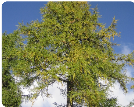
Phénoclim › Color change › Approximately 10% of leaves are beginning to yellow or have fallen off (the rest are green).