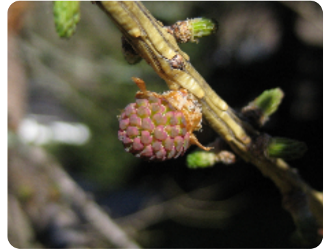
Phénoclim › Flowering › Around 10% of the flowers are open and the rest are closed.