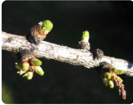
Phénoclim › Budburst › Around 10% of buds are open. The others are closed